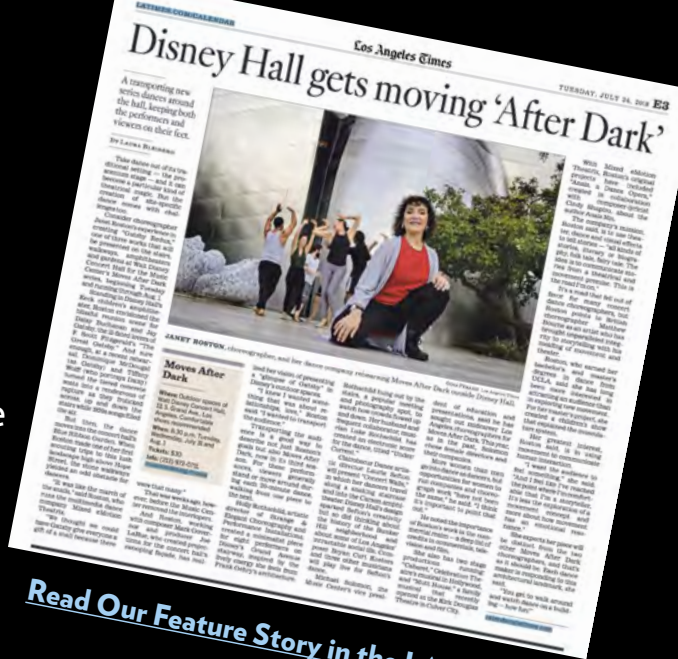
Read Our Feature Story in the LA Times!