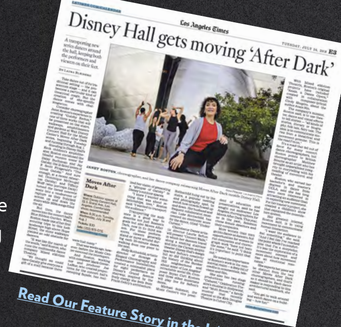
Read Our Feature Story in the LA Times!